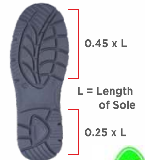
0.45 x L