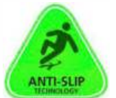
Minimum Cleated area of Sole BIS 15298 6.4.1